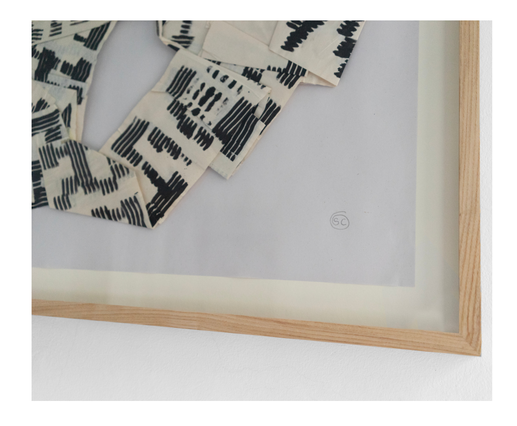
Sun Timer , 2023 Paper, flattened through press 73 x 100 cm (framed) £3,500