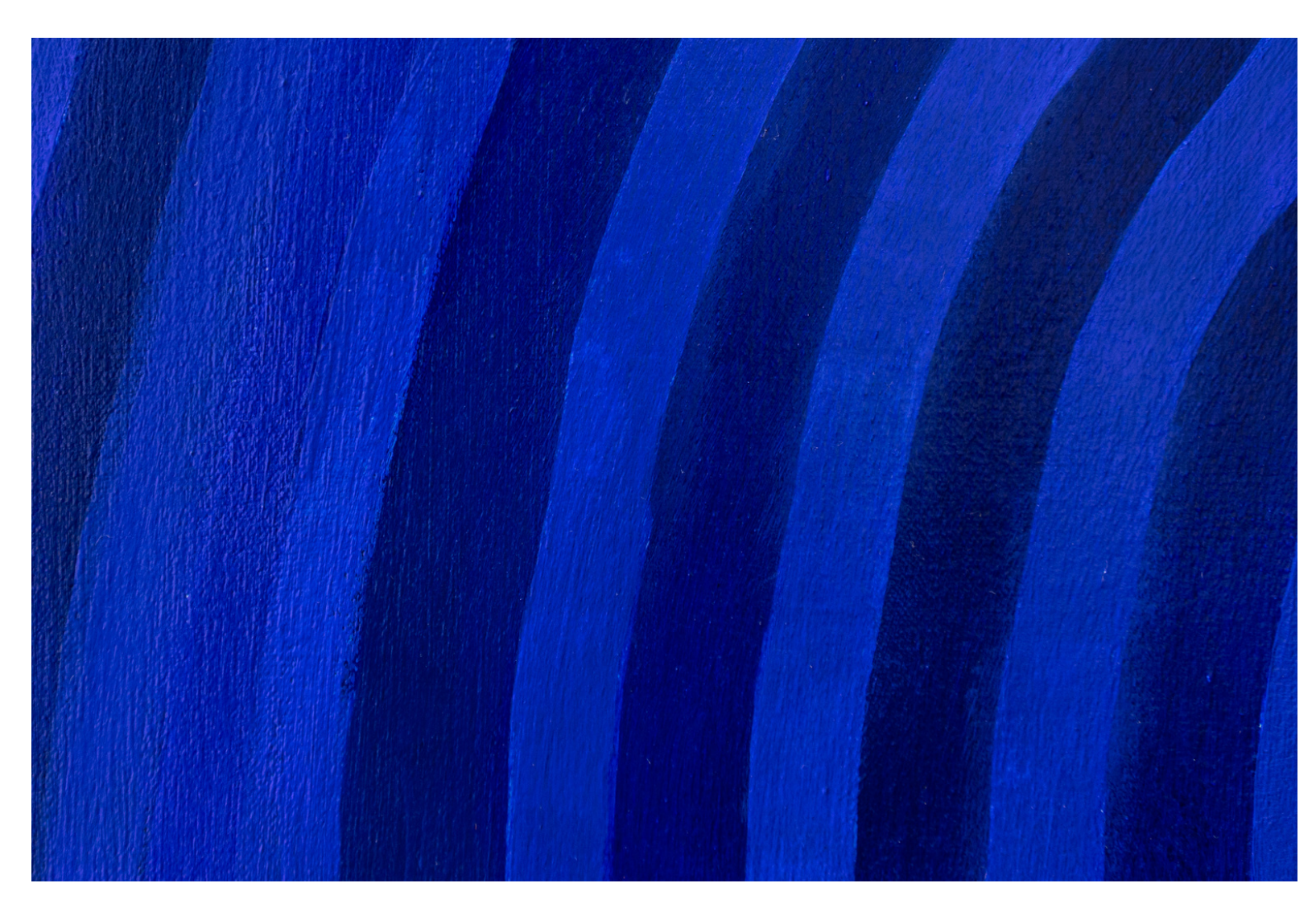
Respiral , 2023 Acrylic on canvas 90 x 90cm £5,500