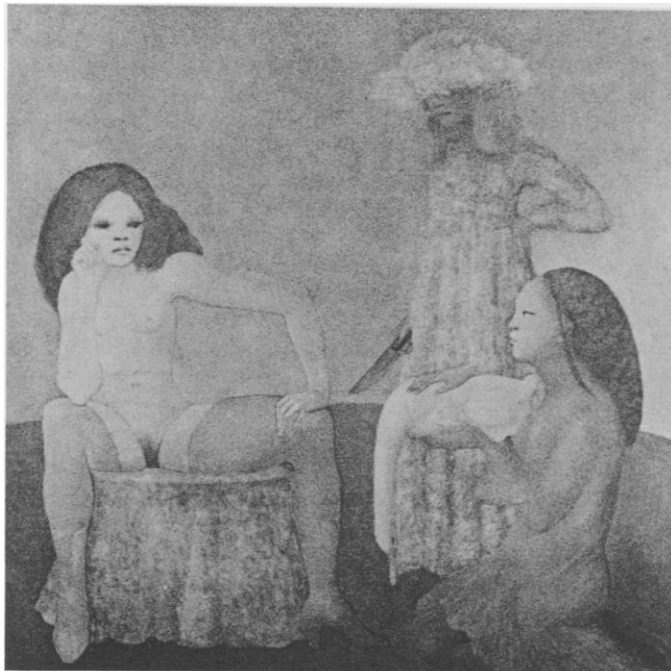
FIG. 1. Léonor Fini, Capital Punishment (1969).

neck. In fact, the "sacrifice" seems cruel and meaningless because the goddess's attention is focused elsewhere.